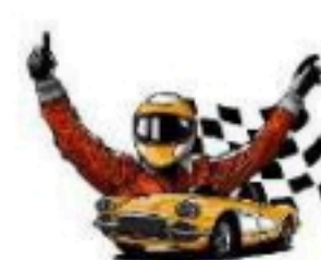
Car race driver