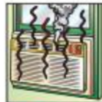
◀ air conditioner— doesn't get cold