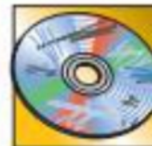
▲ scratched DVD