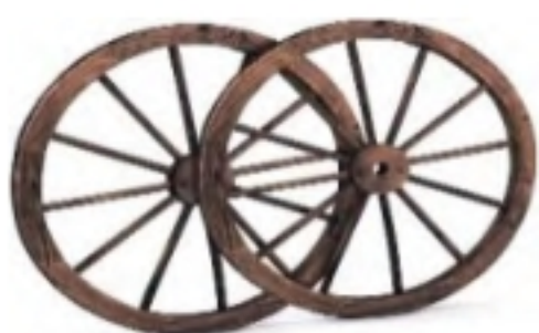
(Wheel - well)