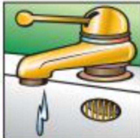
▲ dripping faucet