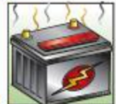
▲ dead battery