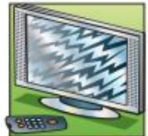
▲ TV—lines on screen