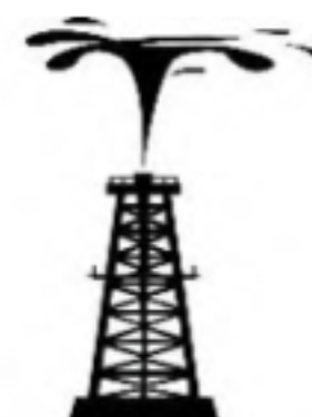
(oil well - penicillin)