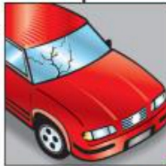
▲ cracked windshield