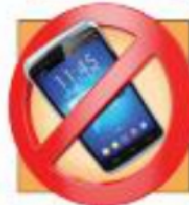
▲ cell phone—no signal