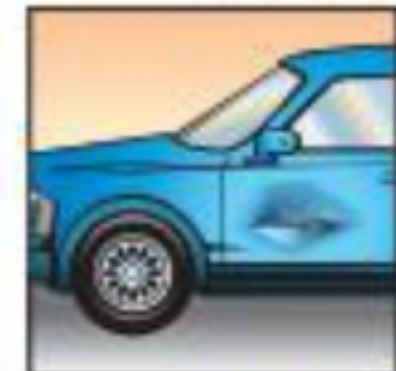
▲ dent in the body