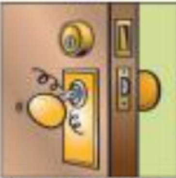
▲ broken doorknob