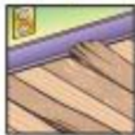
▲ loose floorboards