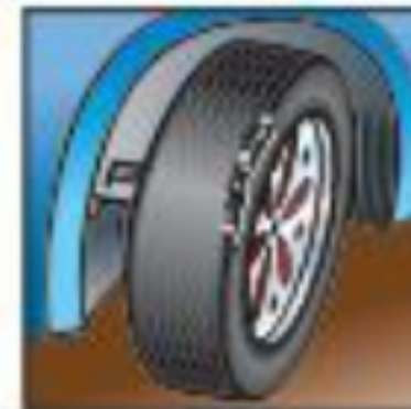
▲ worn tire