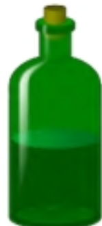
( bottle - glass )