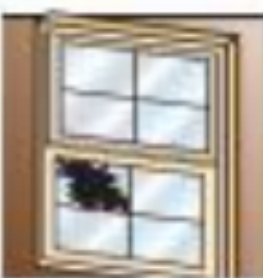
▲ broken windowpane