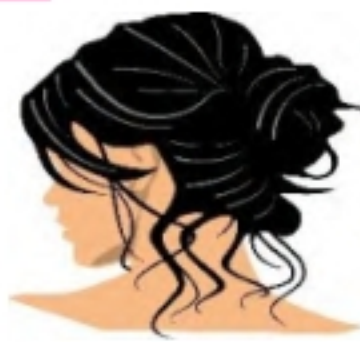
(hairpin - hairstyle )