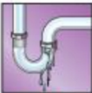
▲ leaky pipe