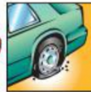
▲ flat tire